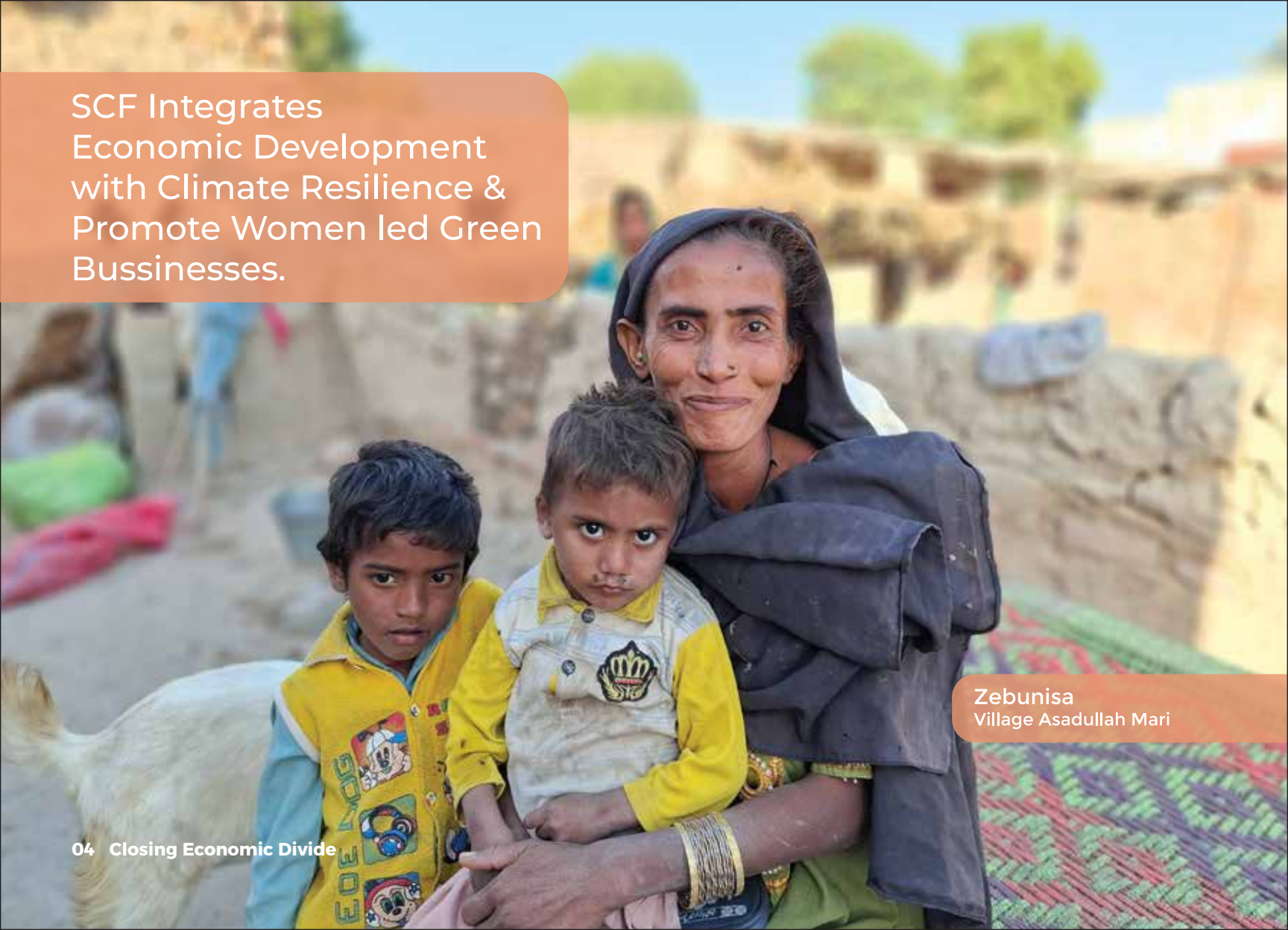
Zebunisa Village Asadullah Mari

SCF Integrates Economic Development with Climate Resilience & Promote Women led Green Bussinesses.